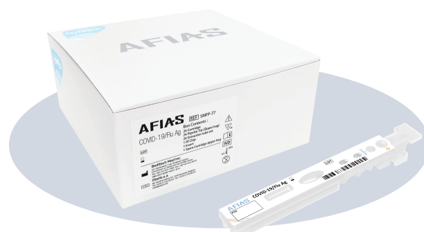
AFIAS COVID-19/Flu Ag Combo

* TRFLFA: Time-resolved fluorescent lateral flow assay